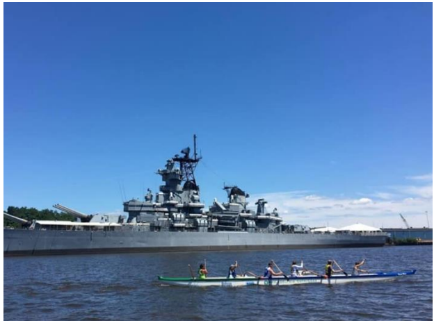
Paddlers next to the USS New Jersey in Camden during the Paddle for Promise event in 2018