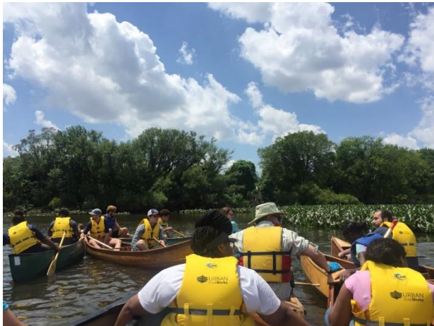
Canoeers along the future site of Cramer Hill Waterfront Park in Camden New Jersey, where the Cooper River meets the Delaware River