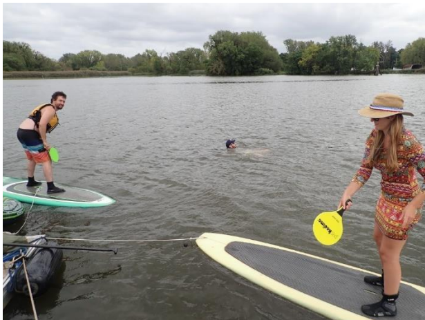
Floatopia on the Delaware River backchannel along Camden in September 2019