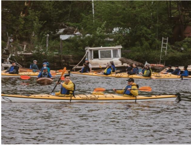
Kayakers in the Delaware River backchannel with the Mayor of Camden at The Mayor's Paddle in May 2019