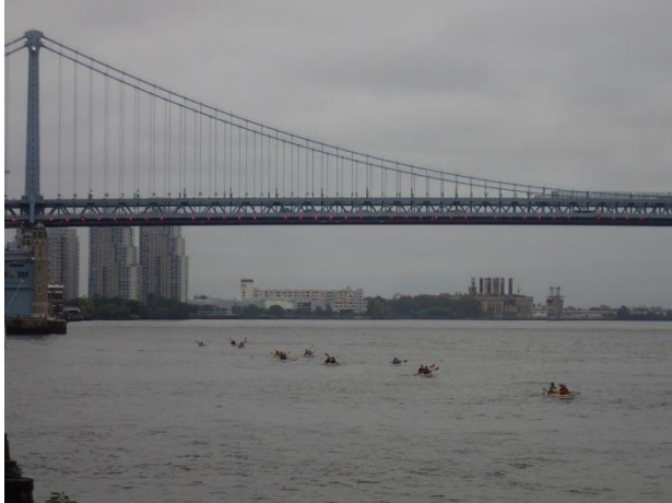
Kayakers under the Ben Franklin Bridge, participating in the Trenton to Camden Paddle in 2018