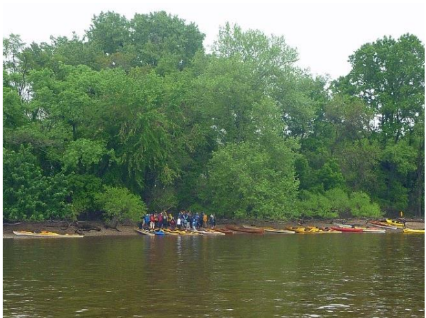
Kayakers on Petty's Island, participating in The Mayor's Paddle in May 2019