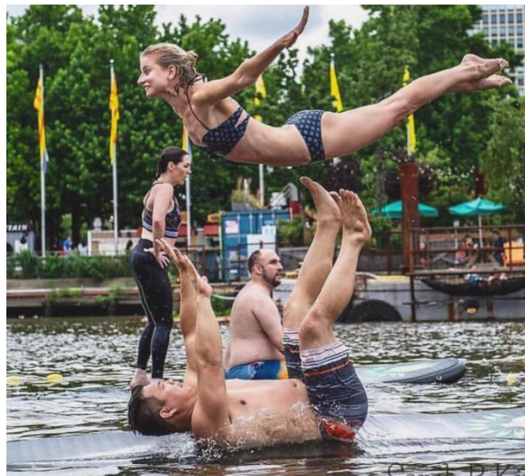
Participants in Aqua Vida's yoga and acro yoga programs at Penn's Landing Marina