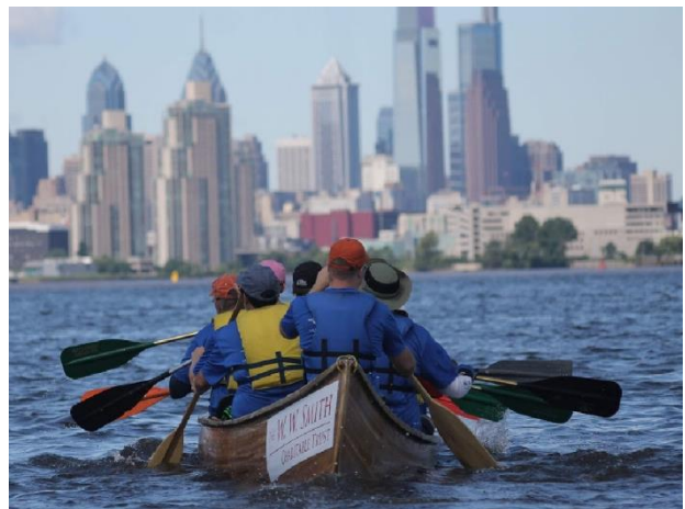
Paddlers canoeing along Philadelphia during the Paddle for Promise event in 2018