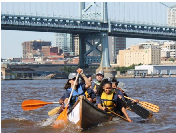
Paddlers near the Ben Franklin Bridge during the Paddle for Promise event in 2018