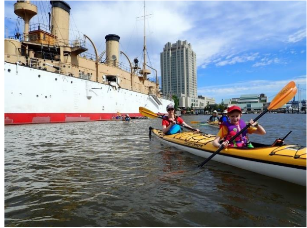
Kayakers behind the USS Olympia at Penn's Landing during a Discover The Delaware event in June 2019