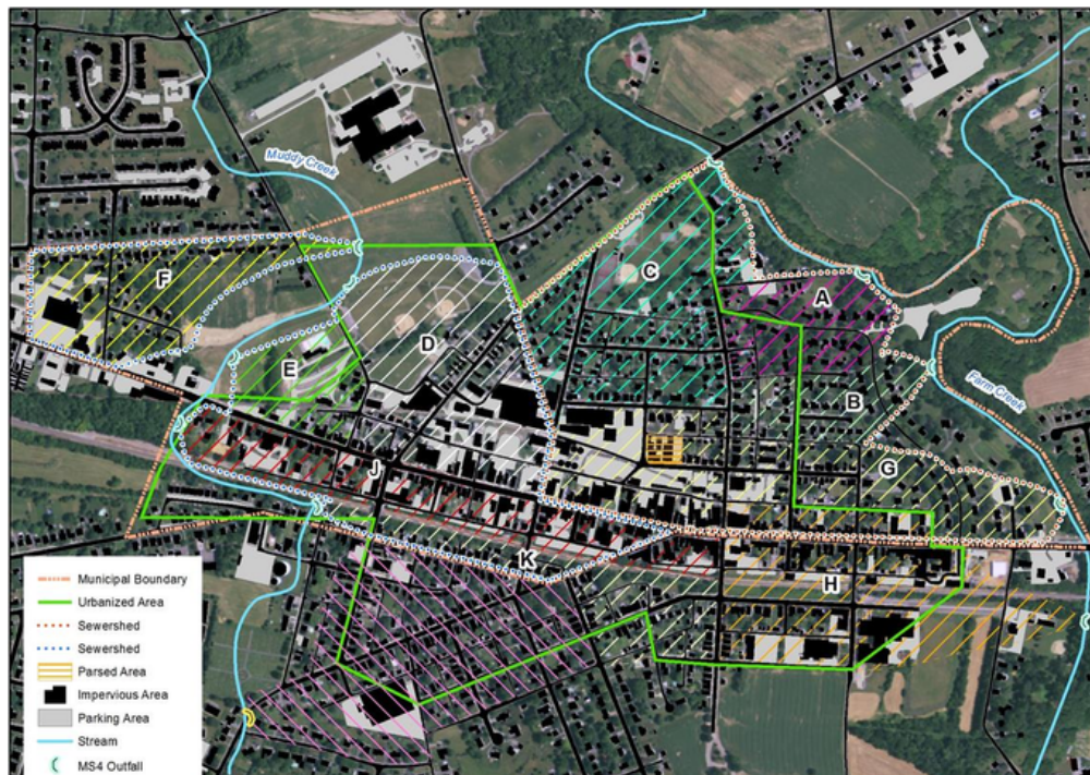
1 DEP. Example storm sewershed map